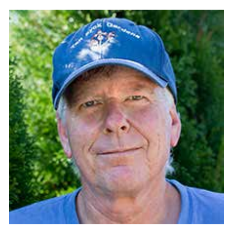
Bill Ten Eyck

"Carl von Linné" by Alexander Roslin - Nationalmuseum press photo, cropped with colors slightly adjusted. Licensed under Public Domain via Commons - https://commons.wikimedia.org/wiki/File:Carl_ von Linn%C3%A9.joid./media/File:Carl_von Linn%C3%A9.joid